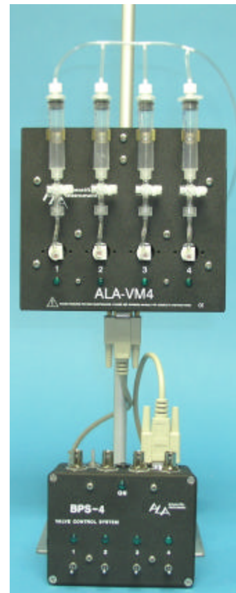
BPS-4SP (Solenoid Pressure) system shown. This is a pressurized system with Lee Co. solenoid valves.