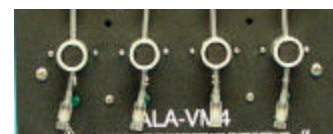
BPS-4PP (Pinch Pressure) valve section shown with pinch valves and compression fittings.